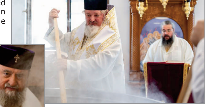
Every diocese of the Romanian Orthodox Church will receive five liters of Holy Chrism.

The Holy Chrism was sanctified during the Divine Liturgy celebrated on Great and Holy Thursday, after being prepared at the All Romanian Saints Monastery in Bucharest during the first days of the Holy Week.